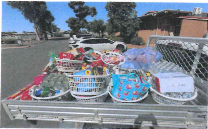
Above is a photo of the baskets of gifts and groceries donated by John Paul College's staff and students.

On Friday night, A group of dedicated parishioners gathered in the St Mary's Parish Centre to sort donations and compile the Christmas Hampers ready for collection and delivery on Saturday. We thank our volunteers for their time and efforts on Friday night, our parishioners for donating groceries and St Mary's PS, St Joseph's PS and John Paul College for their generous contributions as well.